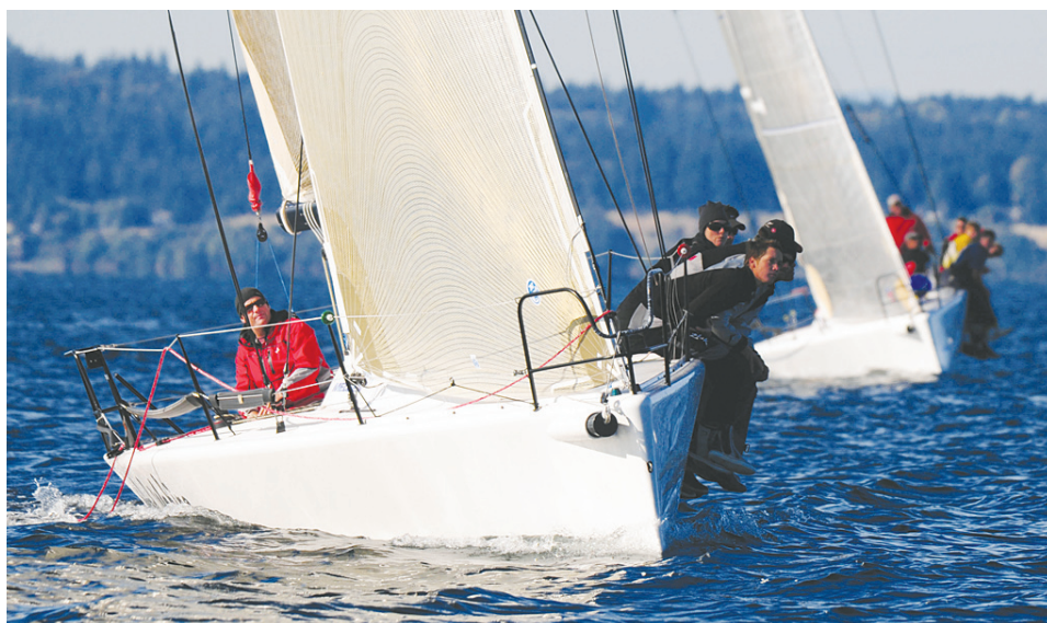
Above: Melges 32's "Banshee" (background) claims 1st place in Fleet P01 while "Wicked Wahine" (foreground) takes 2nd place. Right: The crew on "Kowloon" coming up on the windward mark.