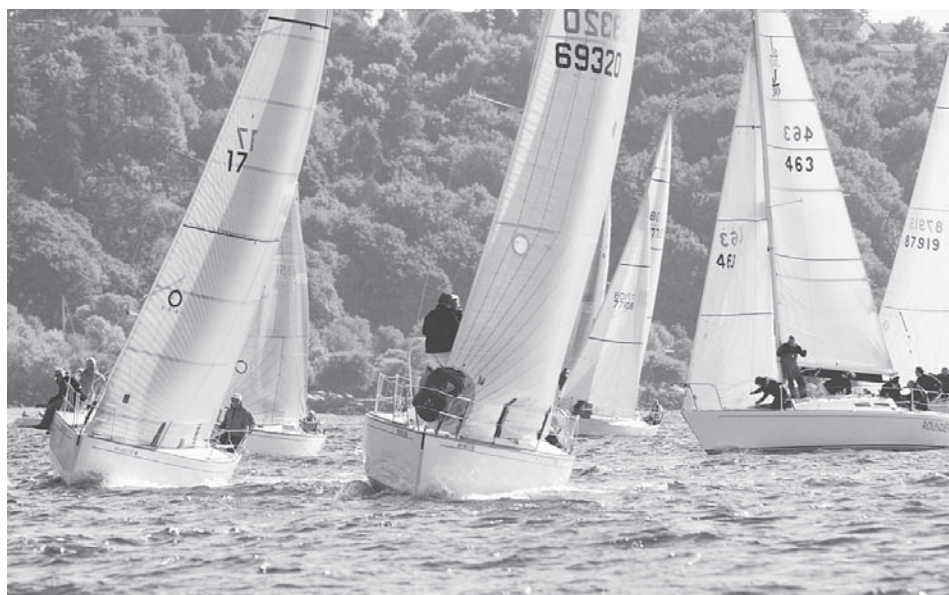
"Rounder", "Kowloon", Rubicon", "French Kiss" and "Outlaw" battle it out in Fleet P09.

On the south course, the race committee quickly set 3-4 mile races that lasted about an hour, with little time between races. Twelve Melges 24s (including some from Idaho and Bellingham) fought hard for the top spots. Lakeview Mortgage won seven of