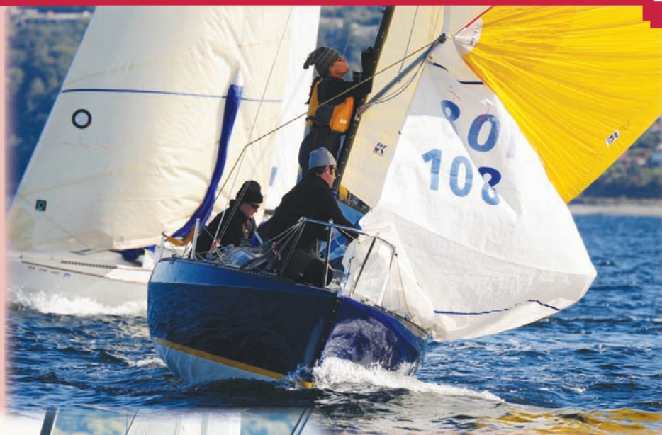
Above: Melges 24's "Runnin' Blues" and "Electric Mayhem" heading downwind.