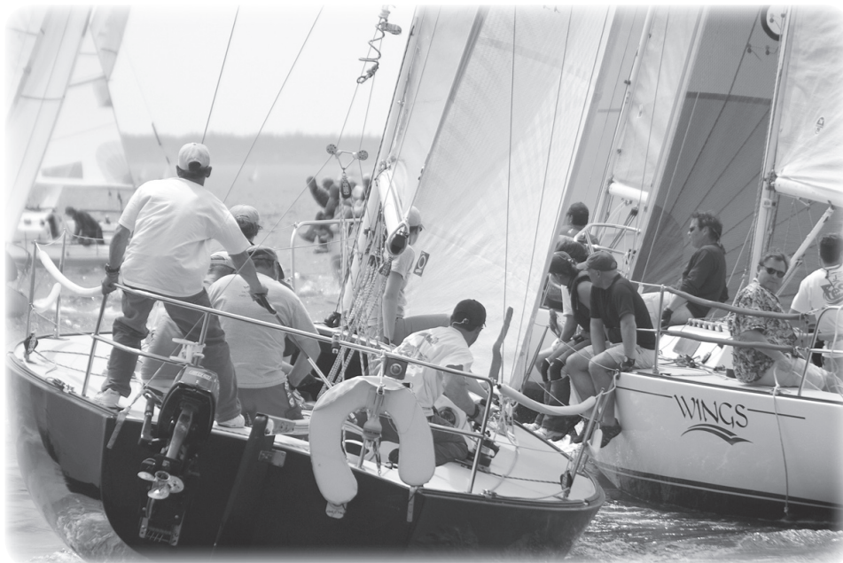
Center: A crowd at the mark makes for some interesting rounding... and it was always crowded!