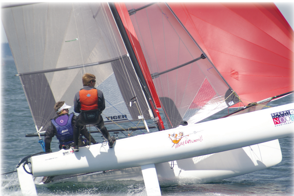
Above: "Highly Catfiented!!" describes this group of Hobie Tigers.

On the south courses, a pocket of wind, affectionately called the "Meadow Point Hurricane" made it possible to finish at least a couple of races for all