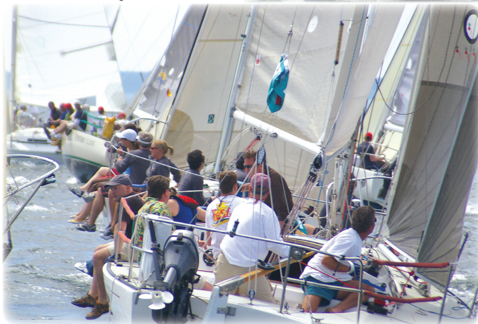
Center: Lots of sailors enjoying the incredible weather and fabulous racing.