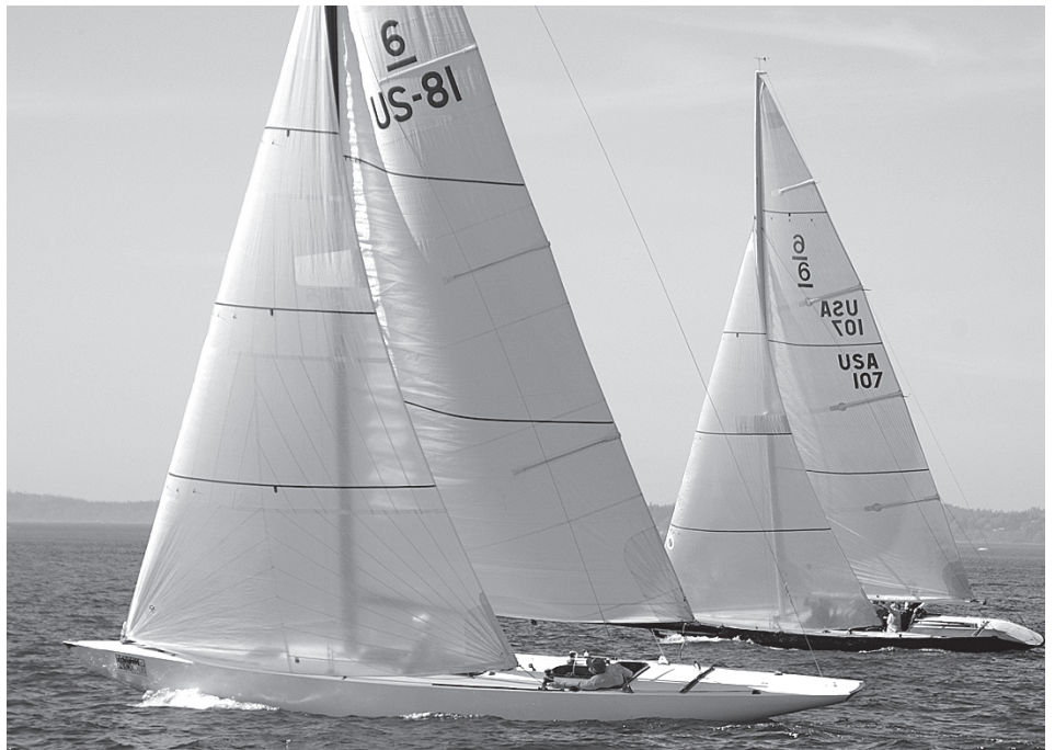
Above: Eight 6 Metres graced Shilshole Bay with their elegance and style.

The event brought sailors and boats from throughout the Pacific Northwest and farther afield. Eleven San Juan 21s, nine Santana 20's (District Championships), six Pocket Rockets, eight 6 Metres and five Ultimate 20s raced. The C&C 115s and Beneteau 36s each had enough entries to get their own starts for the first time in a NOOD regatta.